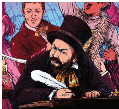
28 Nov–12 Jan A CHRISTMAS CAROL