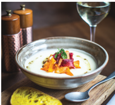
Open Daily (9AM UNTIL LATE) NEW MENUS AT 1766