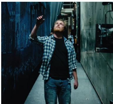
Twice Weekly (EVERY THU & SAT) THEATRE TOURS