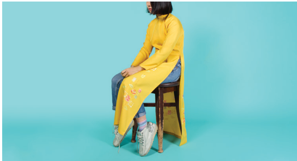
Concept Emilie Chen