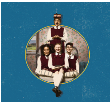
19 Jul–18 Aug MALORY TOWERS