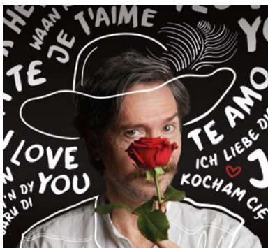
12 Oct–16 Nov CYRANO