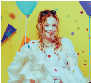
7–28 Sep PRIDE AND PREJUDICE* (*SORT OF)